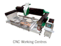
CNC Working Centres